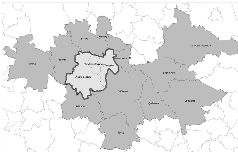
Fig. 1. Delimitation of FUA